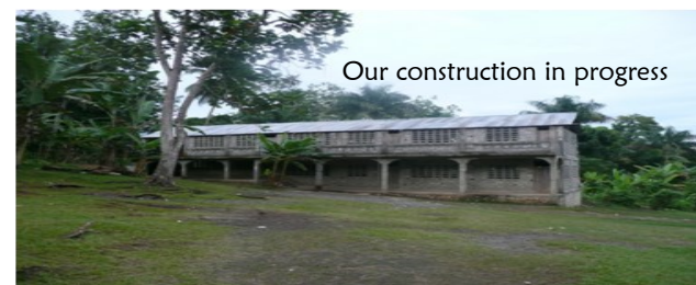
Our construction in progress

Children are taken to the local clinics when sick. Strong efforts are made to pay for the expenses