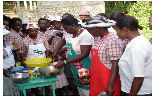
young women in the cooking class.