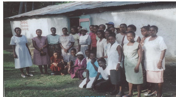
The original school and The support staff.

The ACJFoundation Haïti School and Orphanage