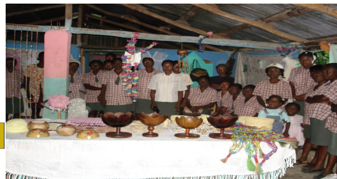
Crafts created by young women

The Anne Clémende Julien Foundation is a non profit organization dedicated toward providing an education to impoverished Haitian children living in Chambellan, Haiti: The foundation's sponsors children who have been abandoned or who have deceased parents. In essence, the Anne Clémende Julien Foundation aims to give children and young adults their basic need for an education, while also supporting and providing for their basic needs for food, shelter and love.